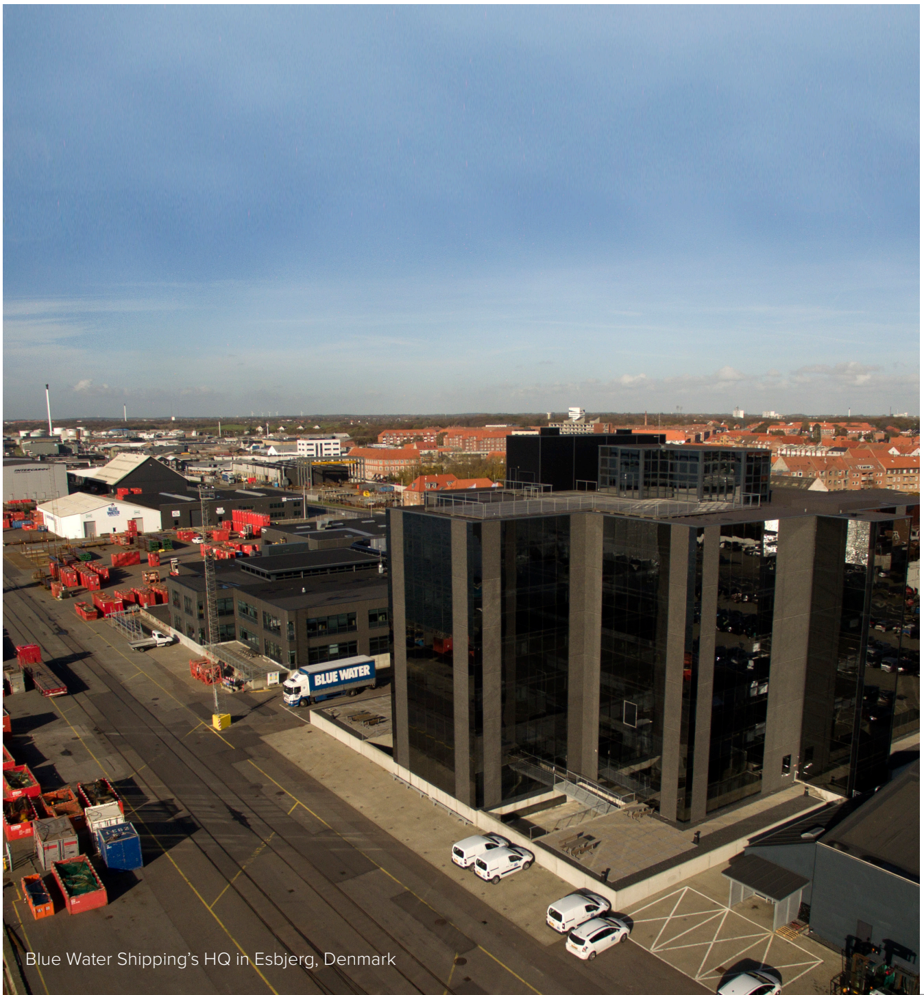
Blue Water Shipping's HQ in Esbjerg, Denmark